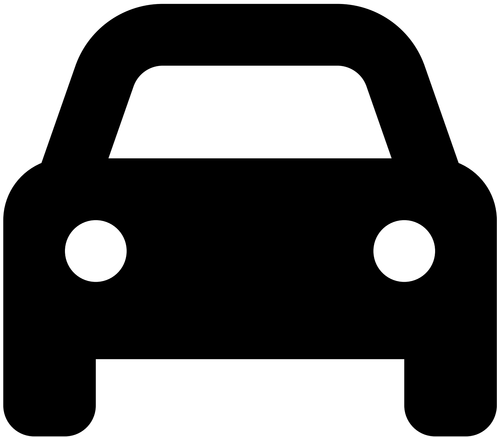
2 Car Garage